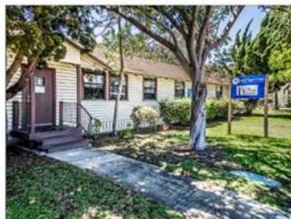
Naval Base Point Loma