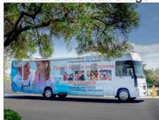
Family Readiness Express

Hours 7:30 – 4:30 Closed Weekends & Federal Holidays