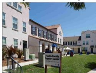
Village at Serra Mesa