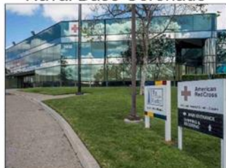
Kearny Mesa Branch

Hours 7:30 – 4:30 Closed Weekends & Federal Holidays