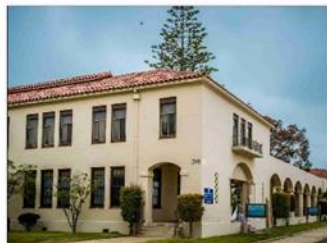
Naval Base Coronado