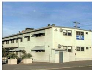
Naval Base San Diego